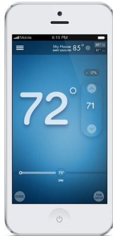
Sensi App - Call for Cooling

Keypad lockout with full control from app